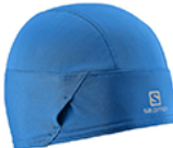
Cap & Beanie or Buff